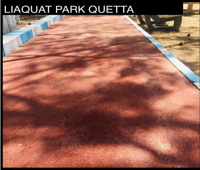
LIAQUAT PARK QUETTA