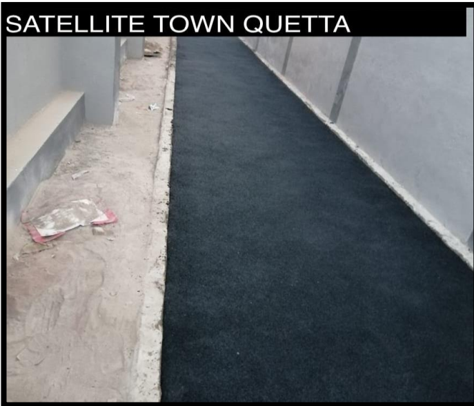
SATELLITE TOWN QUETTA