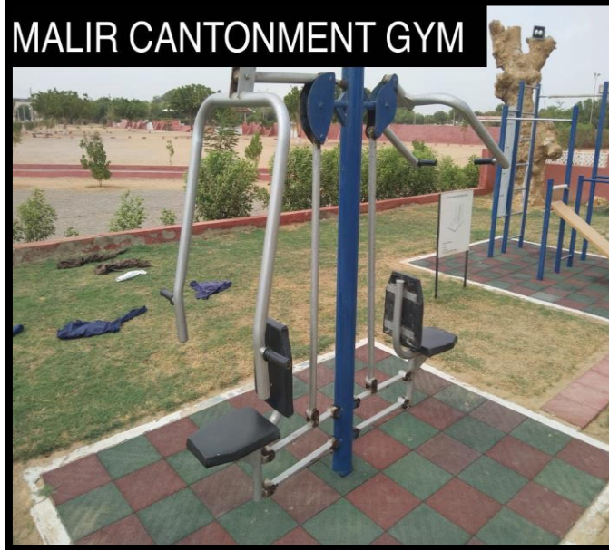
MALIR CANTONMENT GYM