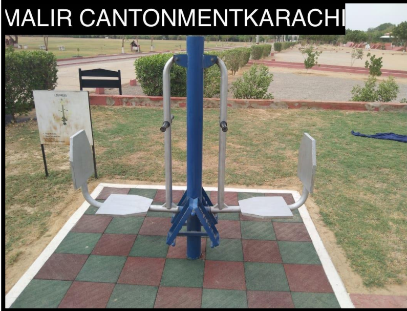
MALIR CANTONMENT KARACHI